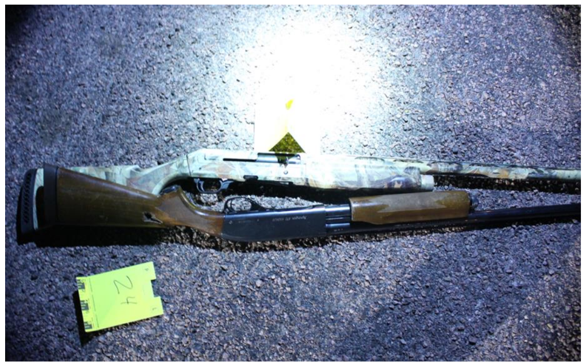
Two 12-gauge shotguns recovered by DCI Agents at the scene possessed by Jondahl.